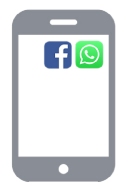
Figure 4: The most used social media platforms by women to market their businesses are Facebook and WhatsApp.

women employees with managing her online business.