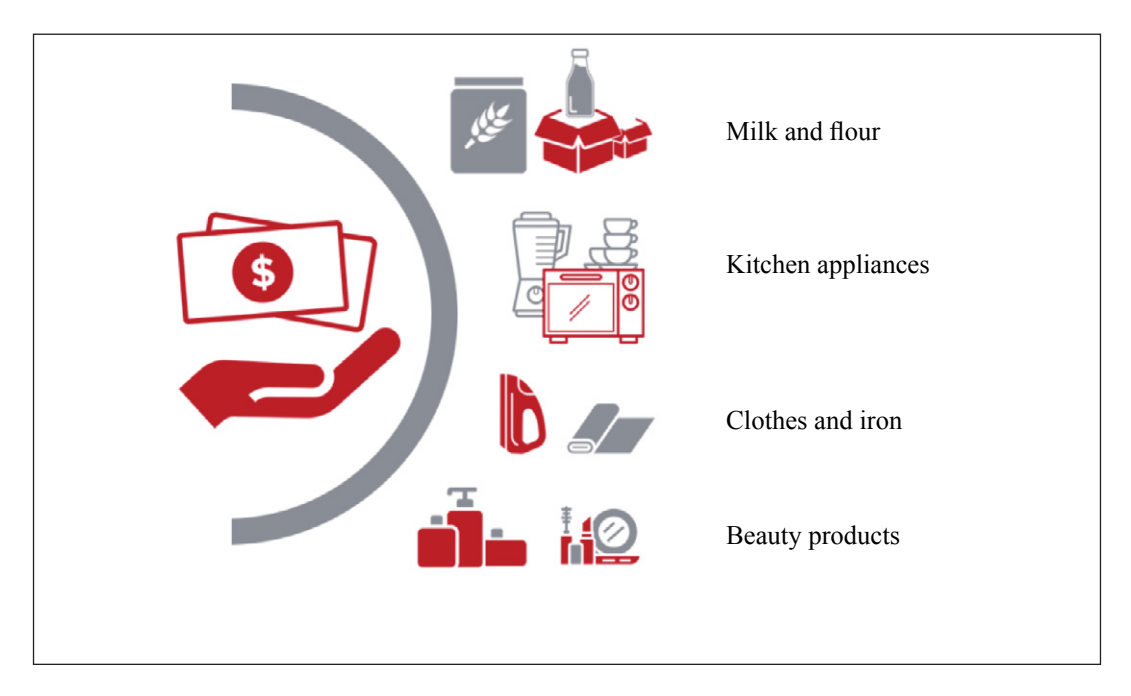
Figure 3: How financial assistance was utilized by women who own home-based businesses

ARDD provided one-time monetary assistance to the HBB owners in the amount of JOD 100 in 2020. Due to this assistance, many women were able to purchase raw materials and equipment needed for their work, as shown in the below graphic.